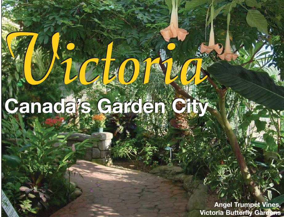
Angel Trumpet Vines, Victoria Butterfly Gardens